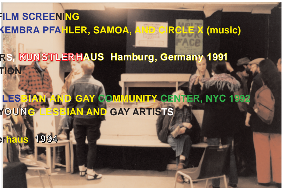
Abc No Rio Photography Workshop at Marta Valle Jr. High School, Manhattan