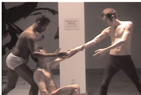
DanceTube at The Chelsea Art Museum, NYC Spring 2003