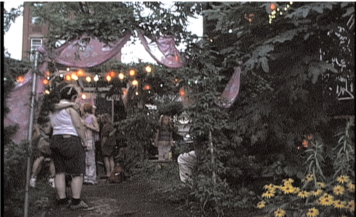
The 2nd Street entrance to Petit Versailles between Avenues B & C

Le Petit Versailles is a community garden on the Lower East Side of Manhattan offering a Spring to Fall schedule of performances, visual art exhibitions, film, music, readings and multi media.